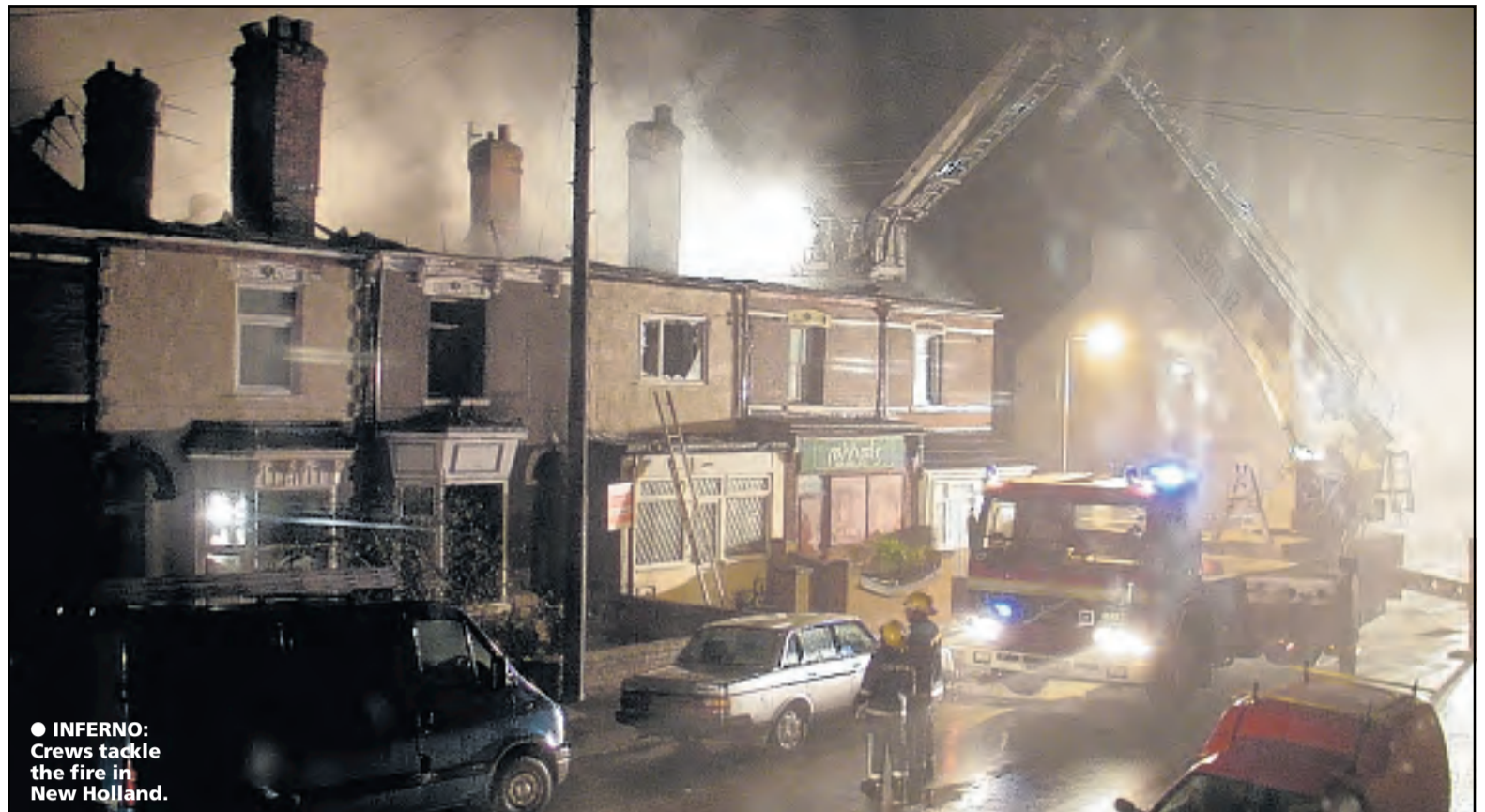
● INFERNO: Crews tackle the fire in New Holland.