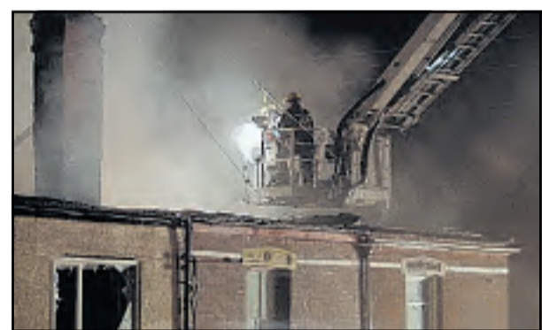
● DESTROYED: Fire crews using a hydraulic lift to tackle the roof blaze.

"I've lost a lot of furniture. I'm standing here in my slippers because my shoes were destroyed.